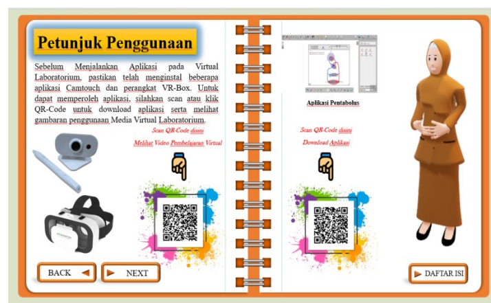
Figure 3. Guidelines for Using Textbooks

Not only that, the use of Virtual Science Laboratory-based textbooks has been empirically proven to be able to make a positive contribution in increasing the visual literacy of prospective teachers. The results of careful research show that the use of the Virtual Science Laboratory significantly improves students' visual literacy skills. The experimental class that used Virtual Laboratory media succeeded in achieving higher achievements in visual literacy assessments compared to the control class that did not use this media.