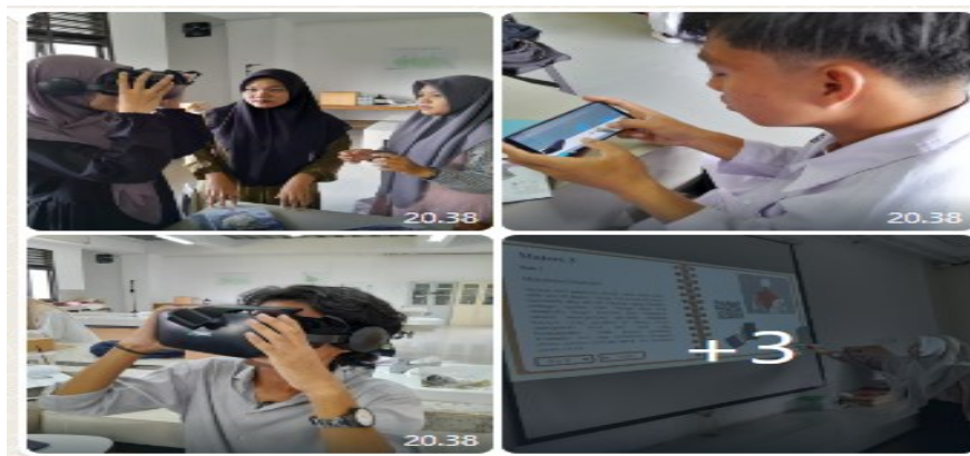
Figure 4. Description of Experiment class activities

This difference arises due to the use of virtual laboratory media which significantly increases students' visual literacy abilities. This media allows students to be more interactive and involved in the learning process, thereby facilitating better understanding and interpretation of visual information. In addition, virtual laboratory media provides a more in-depth practical experience, which ultimately can improve students' visual literacy skills when dealing with learning material. 14