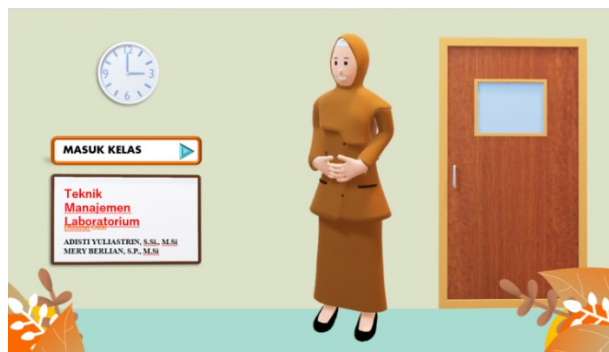
Figure 1. Science Laboratory Virtual Cover Design

Not only that, the use of Virtual Science Laboratory-based textbooks has been empirically proven to be able to make a positive contribution in increasing the visual literacy of prospective teachers. The results of careful research show that the use of the Virtual Science Laboratory significantly improves students' visual literacy skills. The experimental class that used Virtual Laboratory media succeeded in achieving higher achievements in visual literacy assessments compared to the control class that did not use this media.